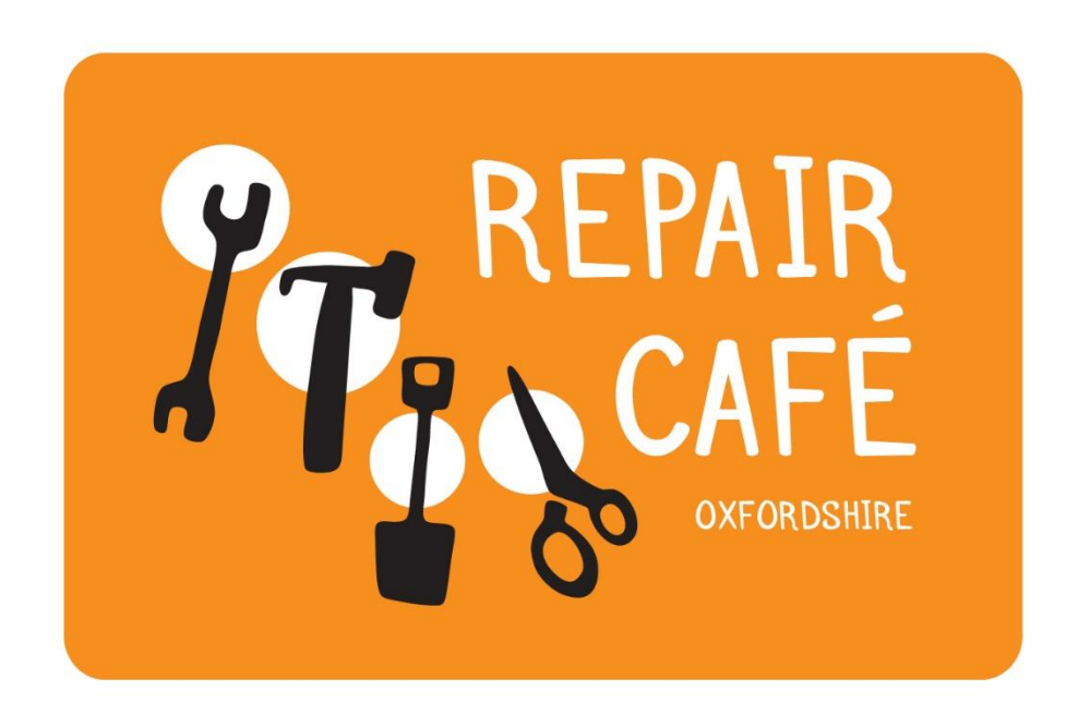
Image from project delivered by Oxfordshire County Council and Community Action Groups

Project specification for WEEE repair, reuse and recycling events